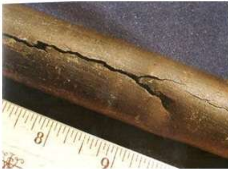
Fig 1.4 Stress Corrosion.

Stress corrosion: This occurs under the simultaneous influence of a static tensile stress and a specific corrosive environment. Stress makes some spots in a body more anodic especially the stress concentration zones which is the anodic part and it corrodes to make the crack wider.