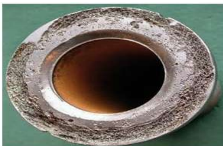
Fig 1.2 Crevice Corrosion.

Crevice corrosion: The oxygen content of water trapped in a crevice is less than that of water which is exposed to air. Due to this the crevice becomes anodic with respect to surrounding metal and hence the corrosion starts inside the crevice.