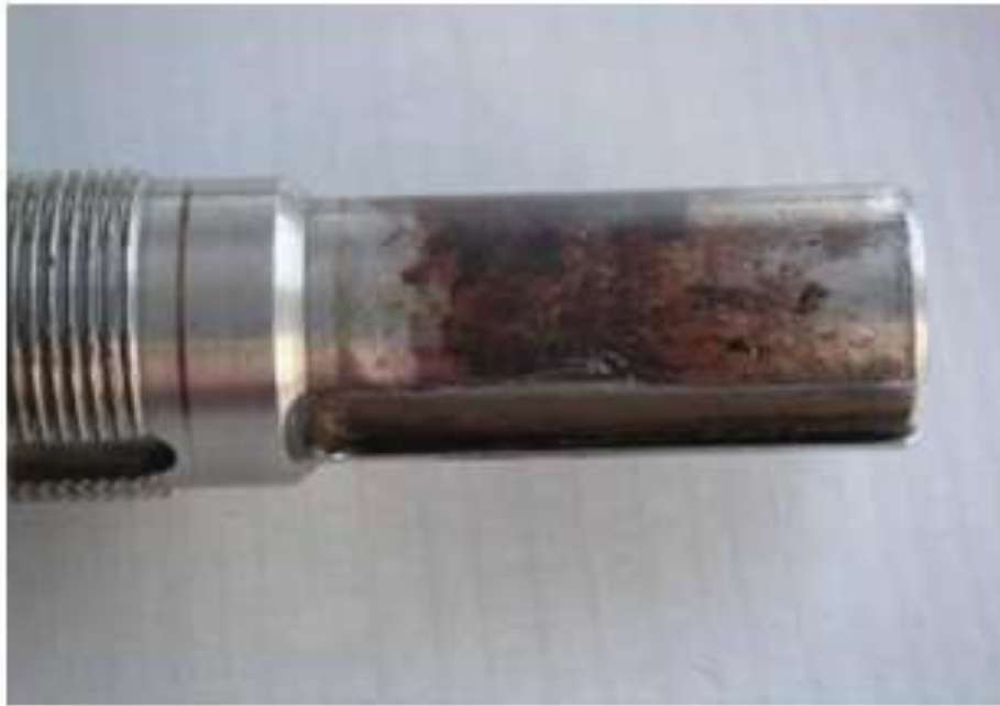
Fig 1.5 Fretting corrosion.