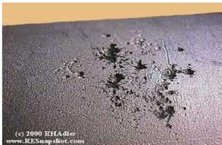
Fig 1.1 Pitting corrosion.

Pitting corrosion: This can occur with mild steel immersed in water or soil. This corrosion occurs due to the presence of moisture or constant exposure to substitute wetting and drying.