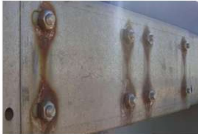
Fig 1.3 Bimetallic Corrosion.

Stress corrosion: This occurs under the simultaneous influence of a static tensile stress and a specific corrosive environment. Stress makes some spots in a body more anodic especially the stress concentration zones which is the anodic part and it corrodes to make the crack wider.