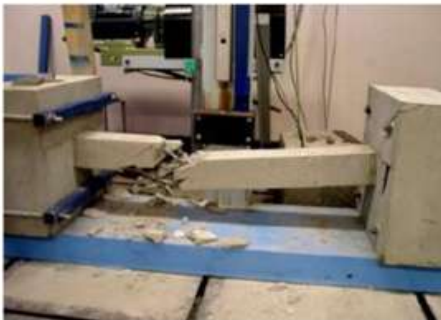
Fig 2.4 Impact Failure.

Creep:- It is the tendency of a solid material to deform permanently under the influence of mechanical stresses. It can occur as a result of long-term exposure to high levels of stress that are still below the yield strength of the material.