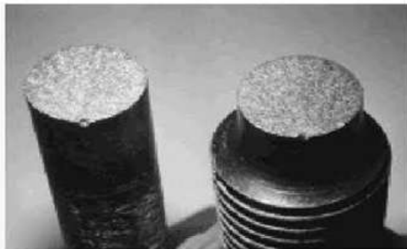
Fig 2.3 Brittle Failure.

Impact Failure: - An impact is a high force or shock applied over a short period of time when two or more bodies clash. Such a force or acceleration usually has a greater effect than a lower force applied over a proportionally longer period. The effect depends critically on the relative velocity of the bodies to one another.